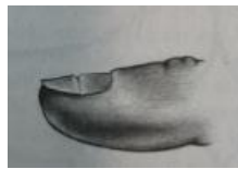
Bump on Nail