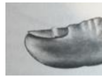
Groove on Nail

Use a finger to press on one of your nails as shown in the image below. How long does it take for the color to return? _____ seconds